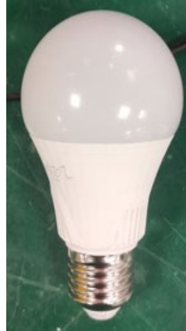
E27 Ballet Series E27