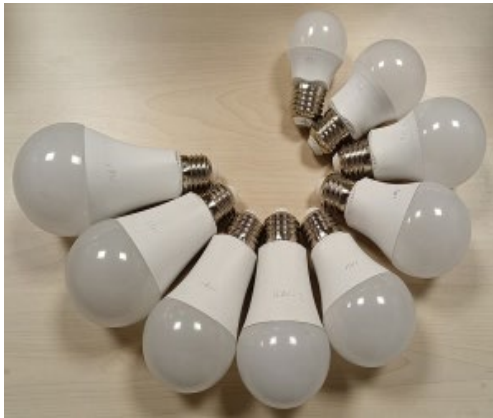
Supernova Series E27